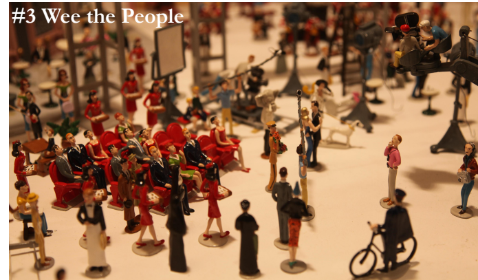
#3 Wee the People